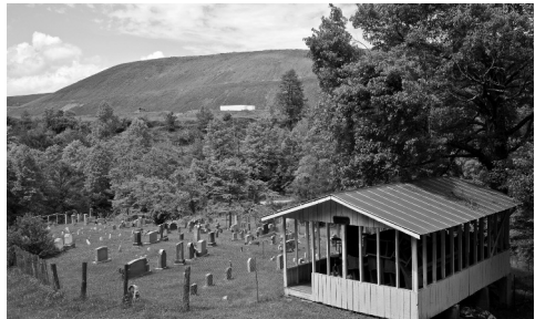
No Rest by Carl Galie

Men and women, even infants – angel stones, tatted granite on the green grave floor – claw at purchase, give out cleaving to that clattered bald yonder.